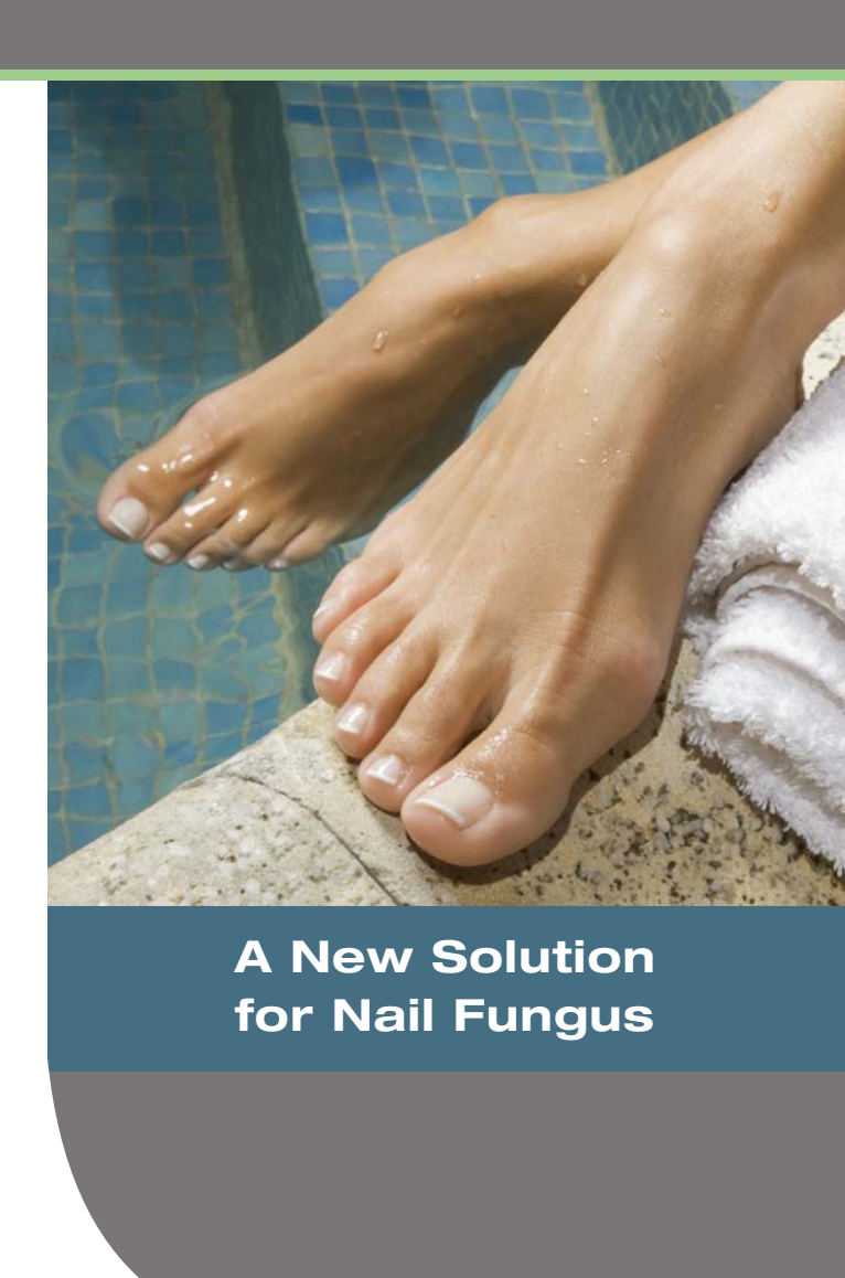
genesisplus<sup>**</sup> Finally Clear Nails for Men and Women

Your nail infection should improve following treatment but you will need to continue with home care techniques to reduce recurrence of the infection as advised by your doctor. There is a chance of re-infection because the fungus is present everywhere in the environment.